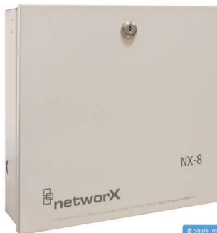
Caddx/GE PC board